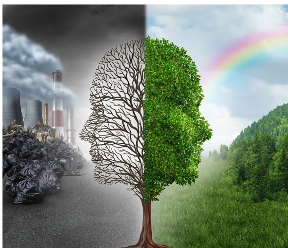
Fig. 1: Air pollution

reduced visibility associated with air pollution. Pollution is occurring both in urban and rural areas in India due to the fast industrialization, urbanization and increase in use of motorcycle transportation. Air pollution threatens the sustainable health of human being and other living organisms in our earth. There are different pollutants that are responsible in disease in living beings. Among them, particulate matter (PM) which penetrate through inhalation and affect respiratory system. 11–14 Ozone in the stratosphere plays a protective and crucial role against ultraviolet irradiation but it is harmful at ground level in high concentration. Other pollutants such as nitrogen oxide, sulfur dioxide, volatile organic compounds and dioxins are all harmful to human health and environment. Carbon monoxide when breathed at higher level is a direct poisoning can bind with hemoglobin and reduce the oxygen level in tissues. Heavy metals such as lead is also direct poisoning when absorbed into the human body can affect the food chain. The best way to tackle this problem is possible through creating public awareness.