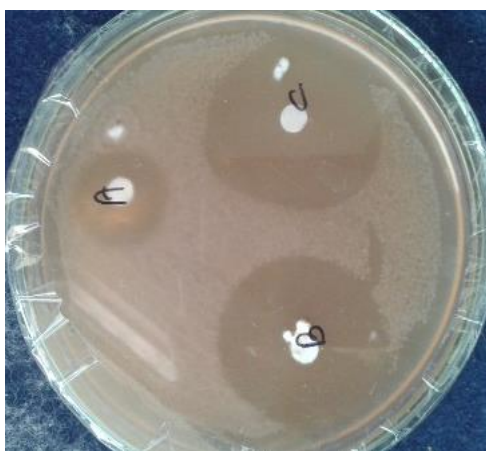
Fig 5: E.coli