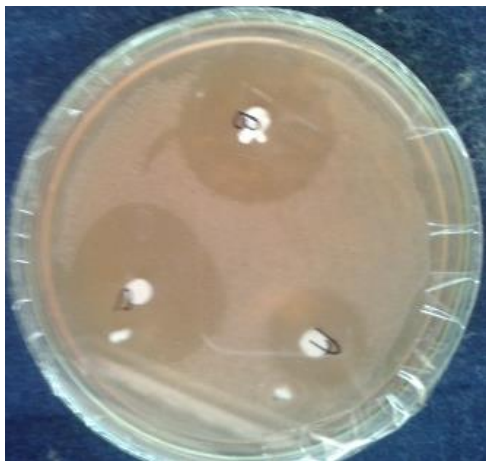
Fig. 4: Brevundimonas diminuta