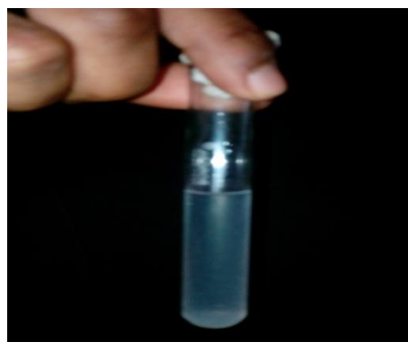
Figure-1: Showing oil

➤ Isolation of clove oil (Hydrodistillation) Clove buds (75 gram) were washed, dried and then weighed. Buds fed inside round bottom flask Clevenger apparatus and the assembled apparatus was allowed to work for 8 hours. After extraction of clove oil by Clevenger apparatus (Fig-2) it was collected and stored in closed glass test tube at 4°C (fig-1).