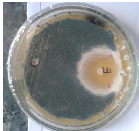
Fig 7: Aspergillus nidulans