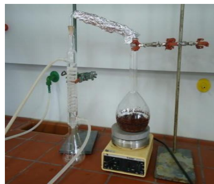
Figure- 2: Clevenger apparatus