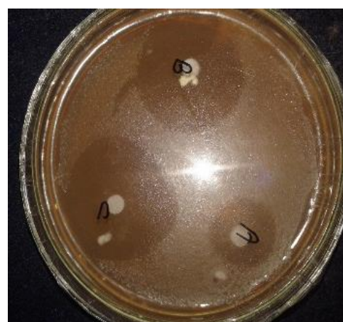
Fig. 3: B.cereus