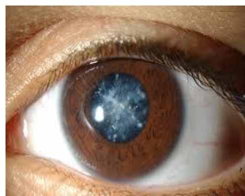
Fig. 2: Diabetic Snow Flake Cataract Discussion

Diabetes is emerging as a major non-communicable disease responsible for morbidity and mortality worldwide. Diabetes shares the main burden of preventable blindness worldwide. Diabetic retinopathy and cataract are the main causes of visual impairment and blindness among the diabetics. 12 Despite these two being preventable causes of blindness, a significant number of people from developing countries having PDR (Proliferative Diabetic