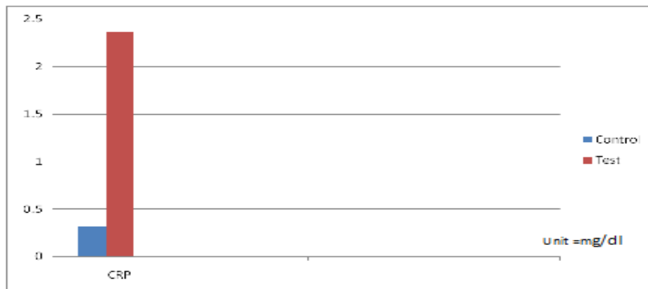
Figure 3: Mean hs-CRP values